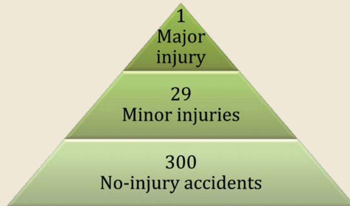
Figure 1 Foundation of a Major Injury